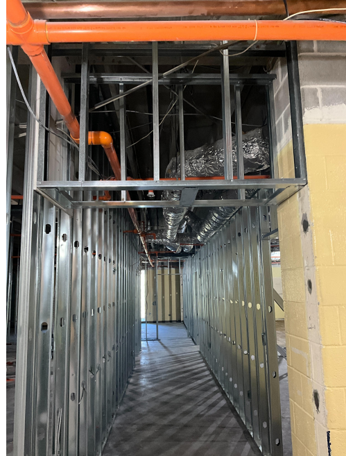
Stud wall framing in classrooms on level 2.