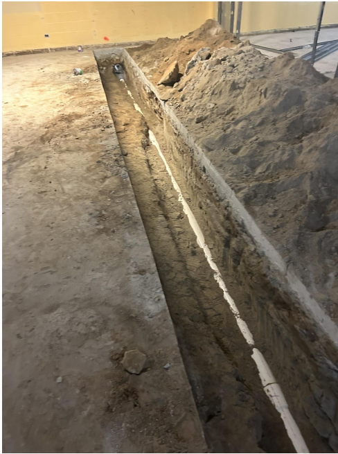
Plumbing rough-in on level 1.